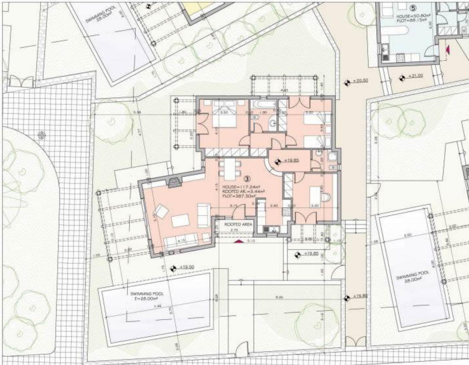
PANORAMA SEAFRONT HOMES II PANORMO CRETE