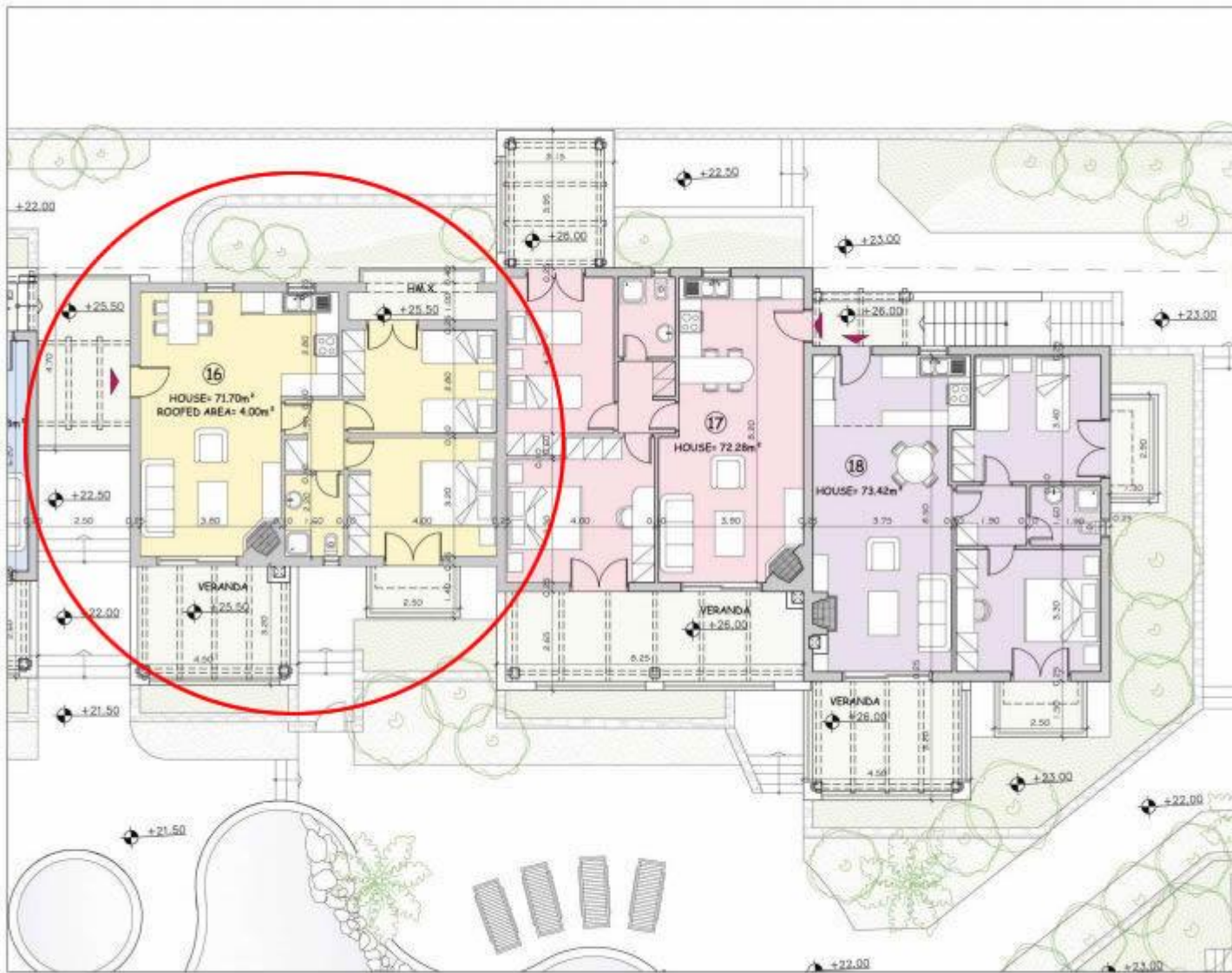
PANORAMA SEAFRONT HOMES II PANORMO CRETE