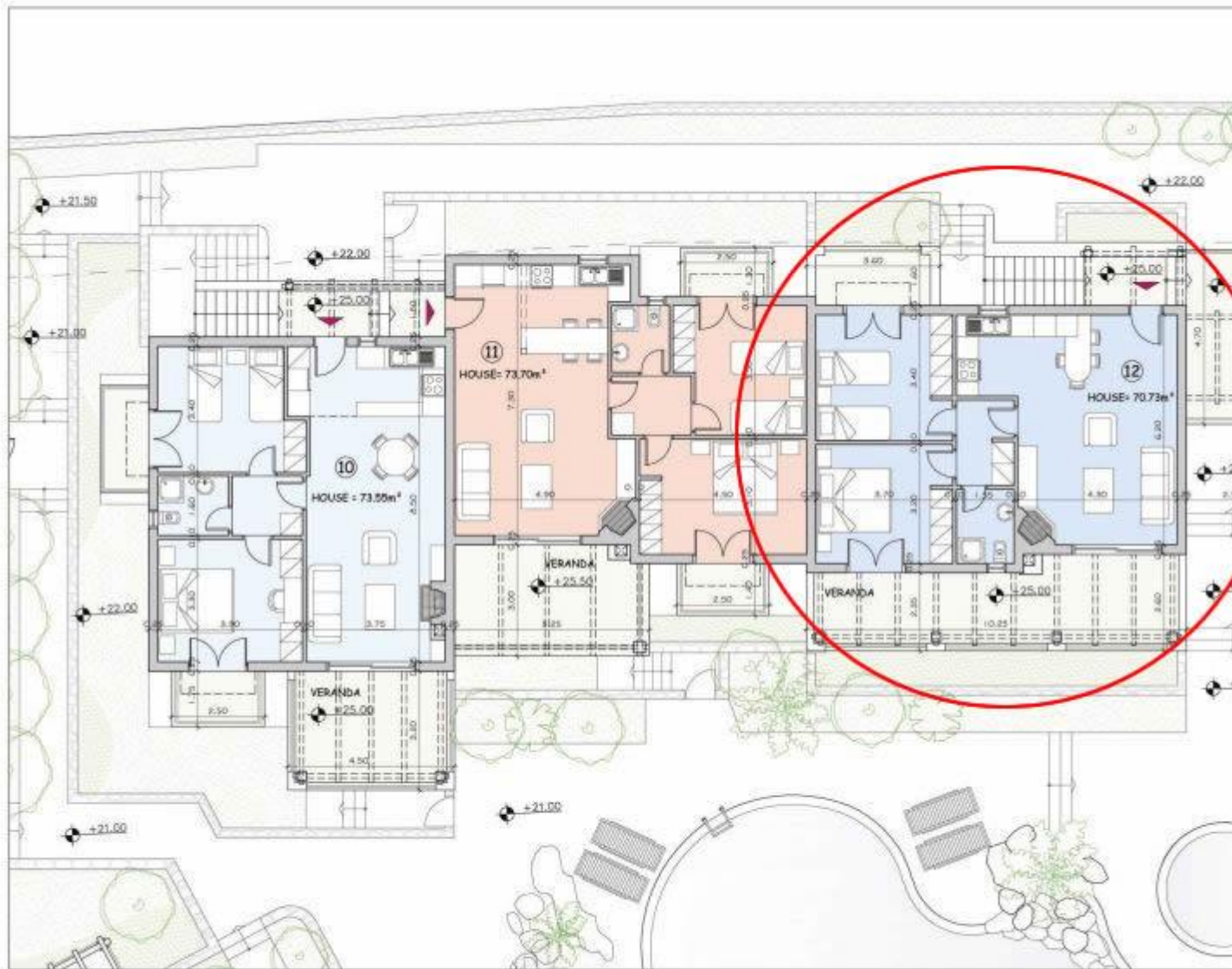
PANORAMA SEAFRONT HOMES II PANORMO CRETE FIRST FLOOR PLANS - HOUSES 10-11-12