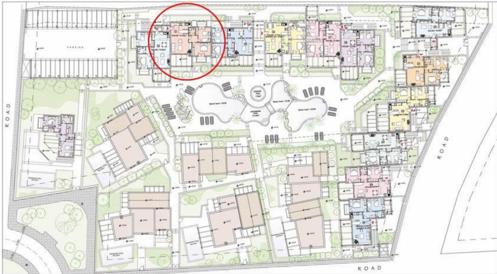
PANORAMA SEAFRONT HOMES II PANORMO CRETE