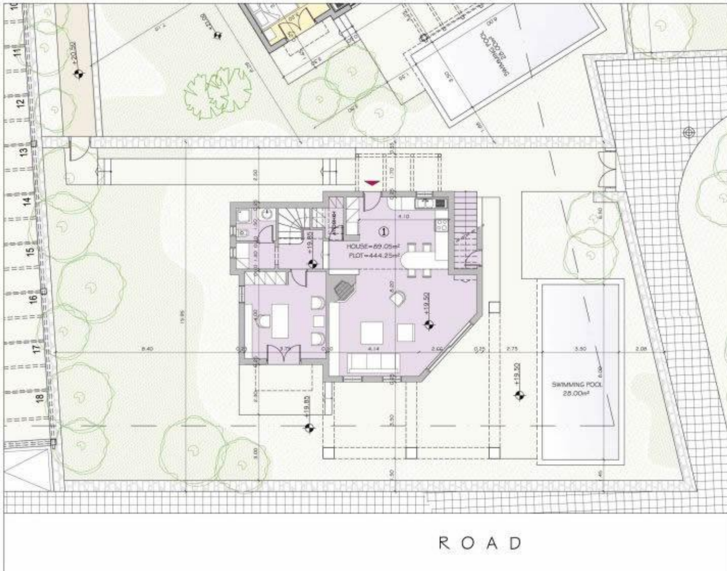
PANORAMA SEAFRONT HOMES II PANORMO CRETE