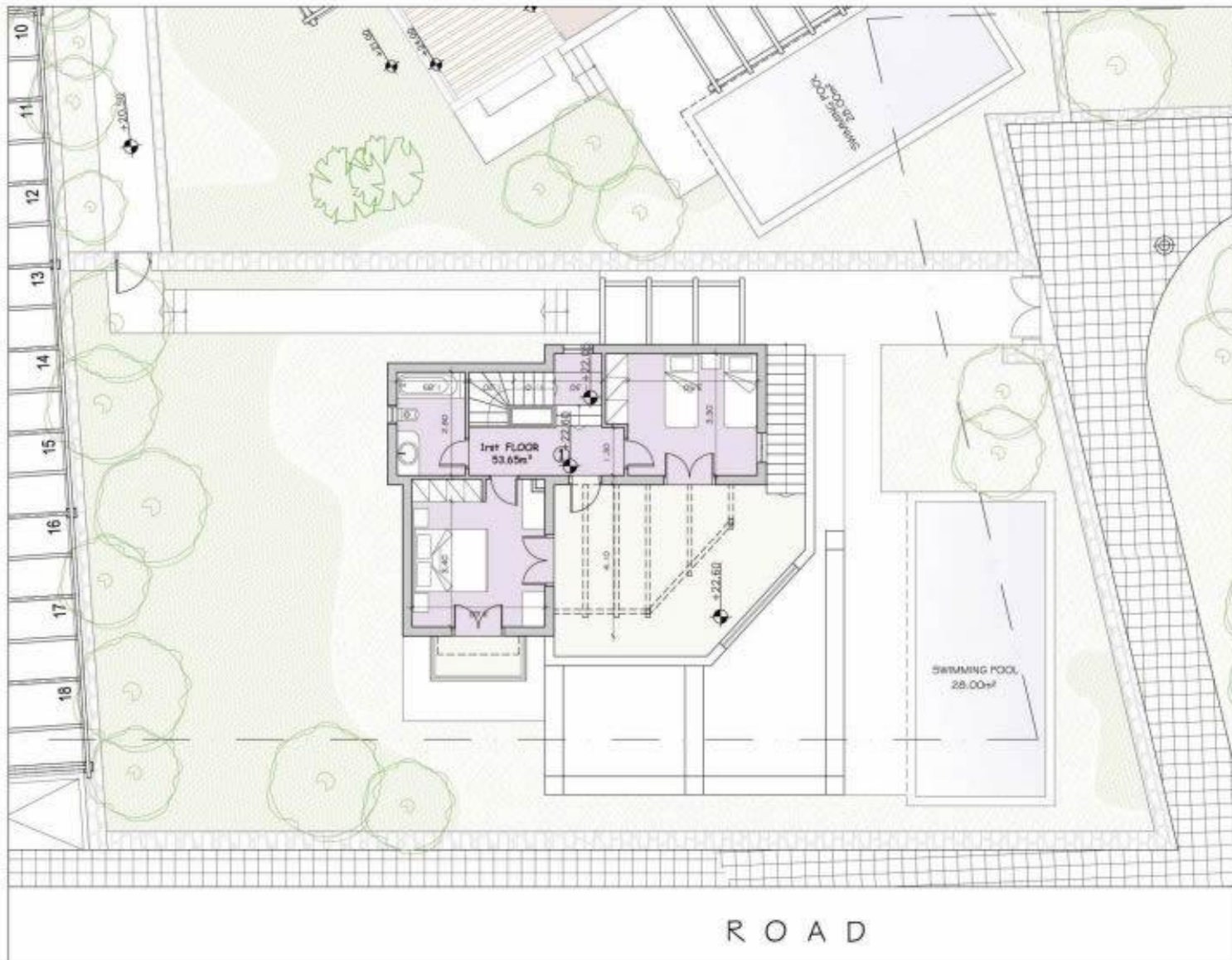
PANORAMA SEAFRONT HOMES II PANORMO CRETE